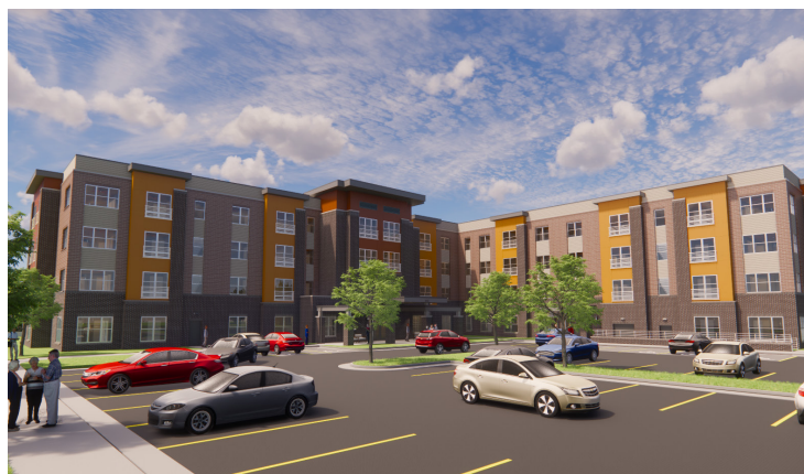
Perspectives by Grimm + Parker