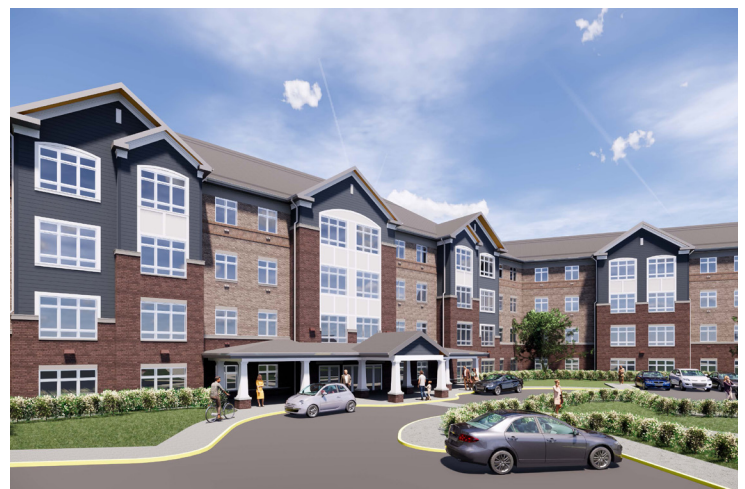
Renderings by Grimm + Parker